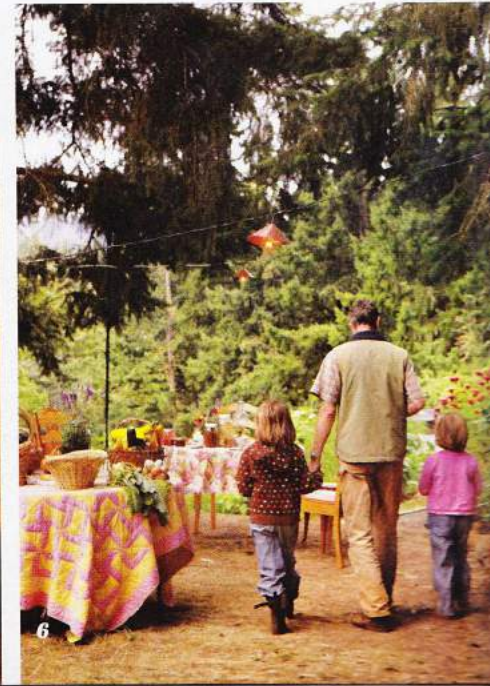
THIS PAGE All pictures taken at Deer Haven Farms Bed & Breakfast 1. Quiche, before owner Christina Sommers pours in the egg mixture 2. The children's playhouse 3. Gathering vegetables from the backyard garden 4. Miniature fairy homes built into the trees 5. Chicken and goose eggs 6. Owner Stuart Sommers walks his daughters to the breakfast table.